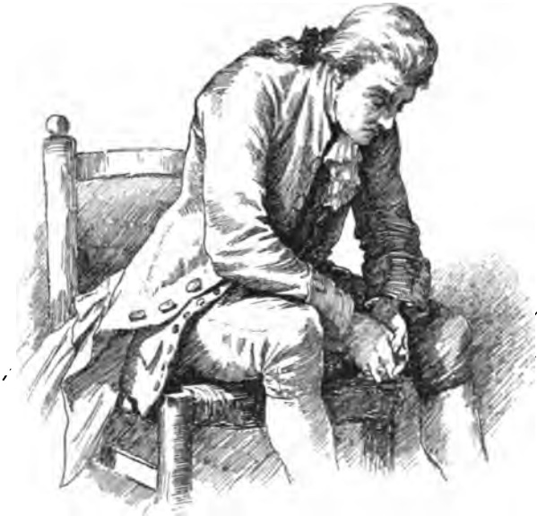
'He would sit motionless and stupefied.'

feeling was exhausted ; and he would sit motionless and stupefied till he was wakened again from this suspension of thought and sensation by some moan of the poor man, or some delirious startings. Toward morning the wounded man lay easier ; and as Ormond was stooping over his bed to see whether he was asleep, Moriarty opened his eyes, and fixing them on Ormond, said, in broken sentences, but so as very distinctly to be heard—